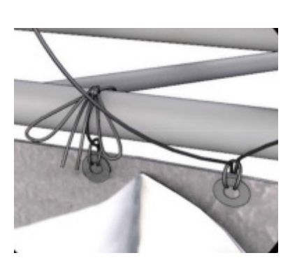
STEP ONE Tie Batty to truss.