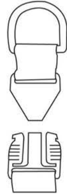
Quick Release Buckle

STEP ONE Starting at one end of the truss, begin to secure the first row of concertina panels using the tie-line provided. The individual panels should be evenly spaced.